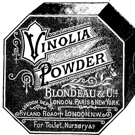
For Redness, Roughness, Toilet, Nursery, &c. In White, Pink, and Cream Tints, 1s. and 1s. 9d. per box.